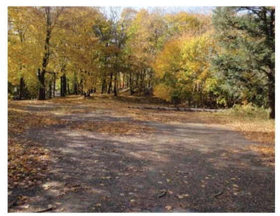
ENHANCEMENTS TO EXISTING PARKING AREA