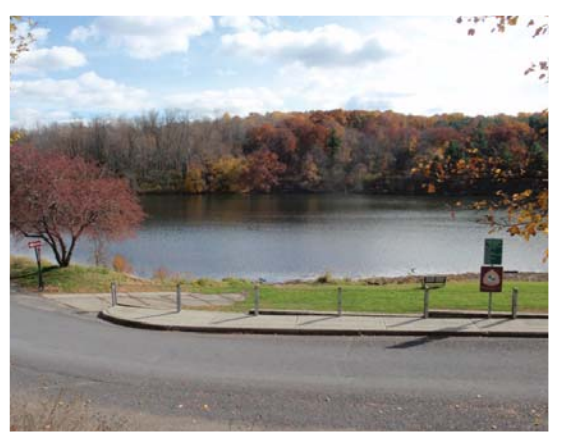
OVERLOOK WITH VIEWS OF SUMMIT RESERVOIR