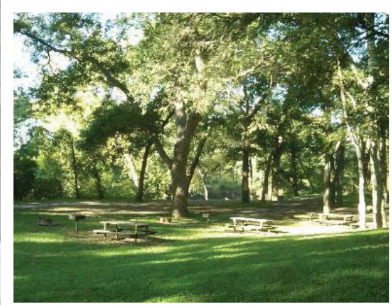
SHADED PICNIC AREA