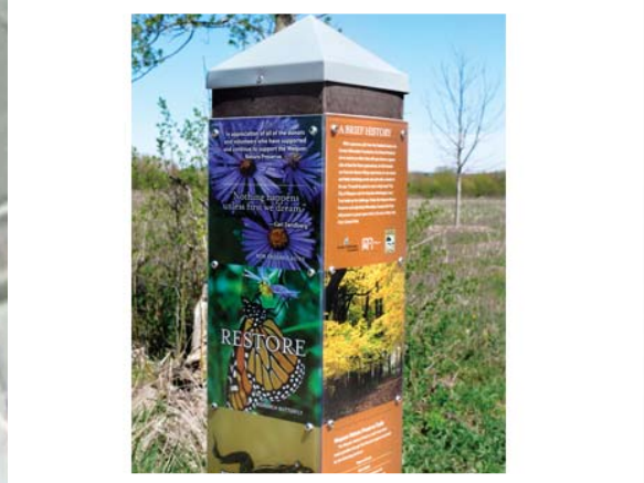
WALKING TRAIL WITH EDUCATIONAL KIOSKS