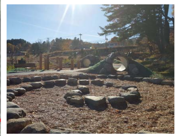
ADVENTURE PLAY AREA TO UTILIZE EXISTING SLOPE